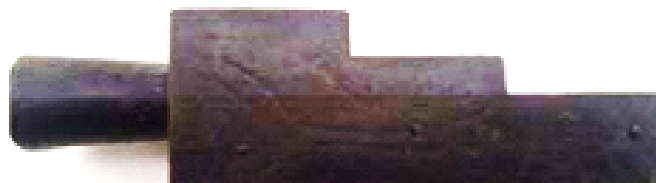
Figure 1. Blend wax pattern for the Experiment

In the experimental test, the blend of wax pattern was castoff as the test specimens. After the designed mixture is melted, pour the melted mixture in to the mold having a shape of the stepped cylinder. In the quality testing, the wax blend was mixed, molded. And the wax pattern is used as specimens for volumetric and linear expansion and surface roughness. The wax pattern is prepared from blend of different wax that is being mixed by using the local bee wax, paraffin wax, tree resin and Vaseline. Figure 1 shows the wax pattern using the mixture of local bee wax and blend of waxes respectively. Prior to the experiment, the control factors and their levels should first be determined. This is shown in Table I.